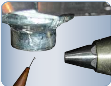
Ice-Free Sample at 8 K using Cryocool-LHe

"What is dramatic about 5 K is the wealth of finer details that become visible."